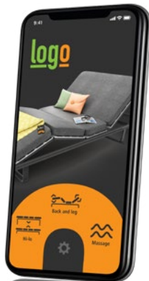
LINAK® Software Development Kit