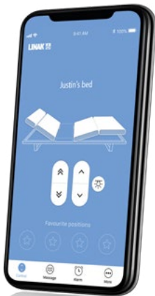
LINAK® Standard Bed Control App

Whatever your needs, we have a solution for you.