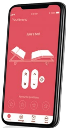
Customisation of the Bed Control App